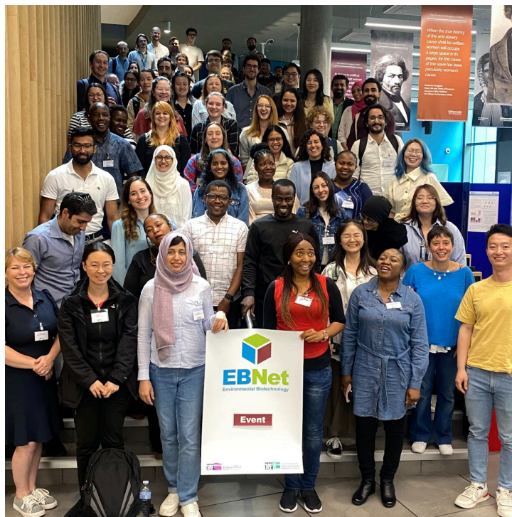
ECR24 conference, Newcastle - 24-26 July 2024