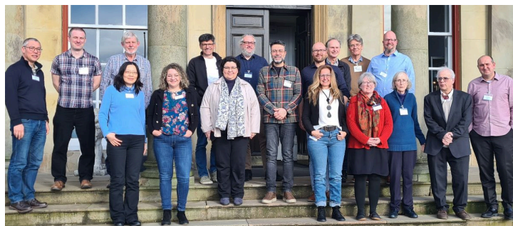
Joint EBNet/ Carbon Recycling Network meeting on Gas Fermentation - Shrigley Hall, 27-28 March 2024