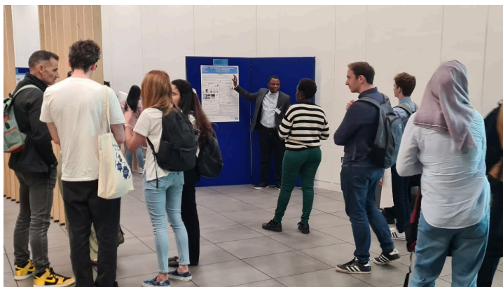
ECR24 conference poster session, Newcastle - 24-26 July 2024

Engineering and Physical Sciences Research Council