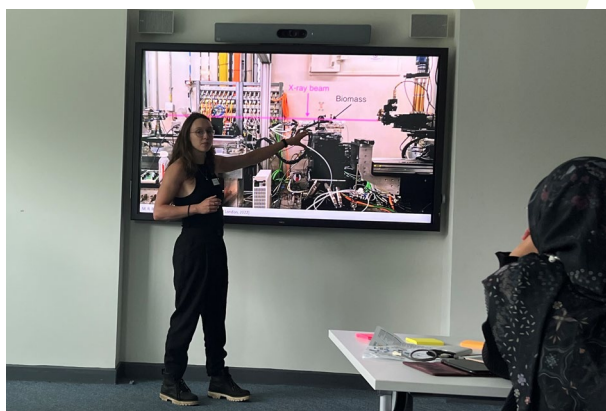
Results and presentations