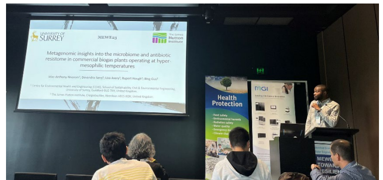
Presenting at MEWE 10

The study aligns with two out of the three research themes within EBNet's remit: (a) Pollutants and media, and (b) Biosciences to engineering. In the case of the first theme, the study identifies antibiotic resistance genes (ARGs) as critical environmental pollutants and comprehensively captures their fate from the feedstock down to the primary and secondary phases of industrial-scale anaerobic digestion (AD). It is widely acknowledged that the abundance of ARGs in the digestate (anaerobically digested waste) should be curtailed to ensure the usual practice of recycling digestate to agricultural lands does not constitute serious public health risks. The results of the AMR trends derived from the study could ultimately provide a realistic baseline for the assessment of risks from digestate-borne ARGs.